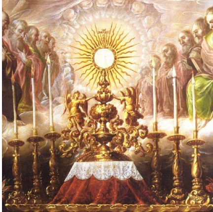
"D. N. Iesu Christi universorum Regis" (Our Lord Jesus Christ King of the Universe)